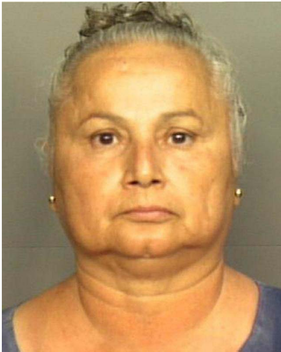
Griselda Blanco, also known as the "Cocaine Godmother" and "The Black Widow." Here are 5 things to know about her.

You may be wondering, who is Griselda Blanco and just how big was she? Griselda Blanco is the real-life drug godmother . Originally from Colombia, Griselda was a pioneer of drug trafficking in the United States, specifically in New York and, eventually, Miami. There she became the "Cocaine Godmother," one of the fiercest and most influential drug leaders in the 1970s and early 1980s. In light of the new HBO film, here are 5 things to know about her.