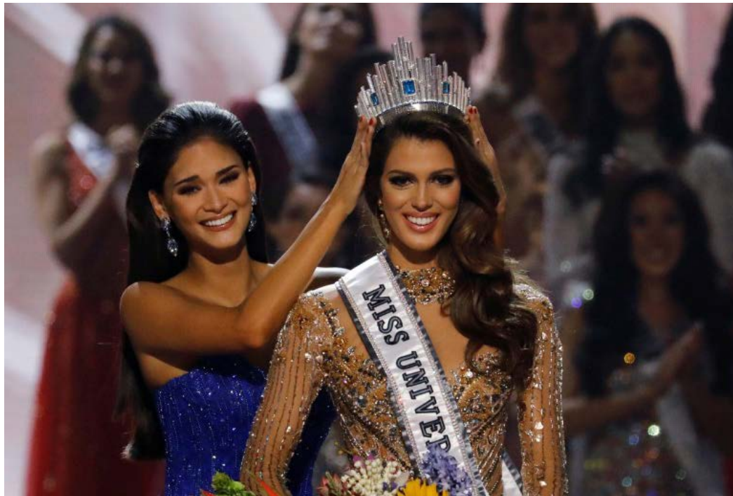
We have a new Miss Universe! Miss France Iris Mittenhaere was named the most beautiful woman in the world, becoming the second lady to bring the crown to France. But which country has the most Miss Universe titles?