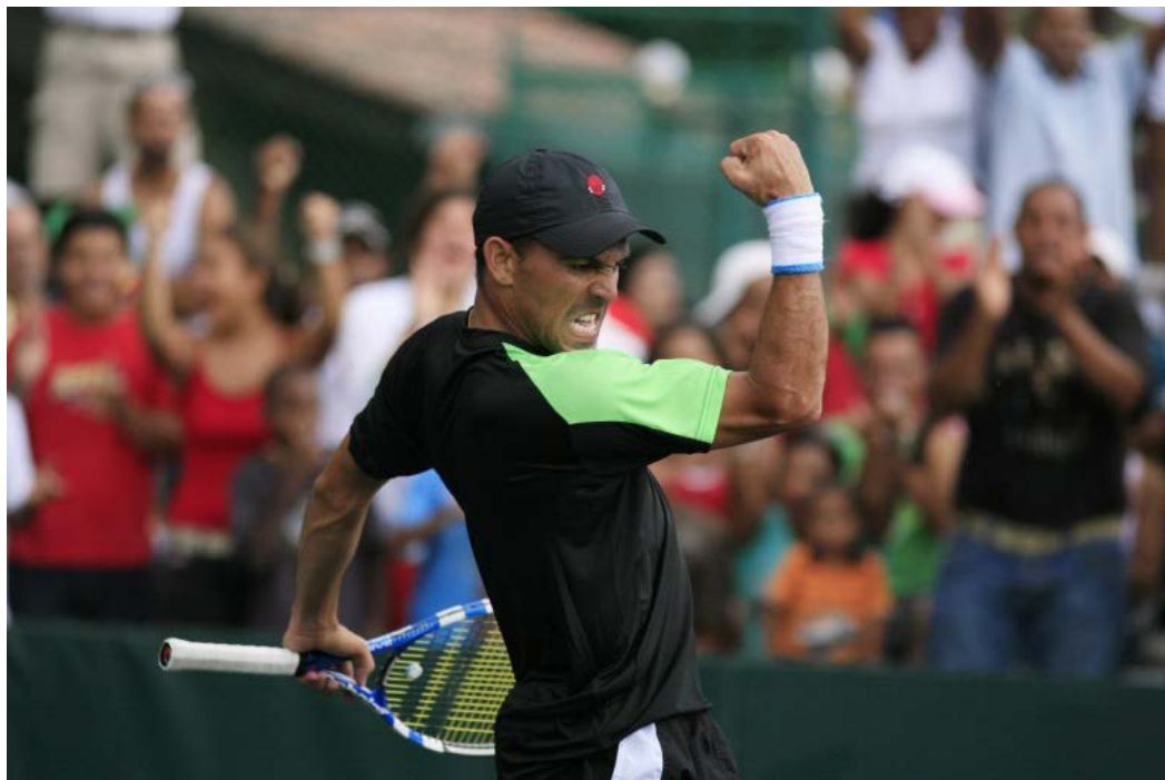
Víctor Estrella Burgos became the first Dominican to participate in a Grand Slam tournament. Although he lost in France and Wimbledon, he had a great start at the US Open. Here are 6 things to know about this tennis player.