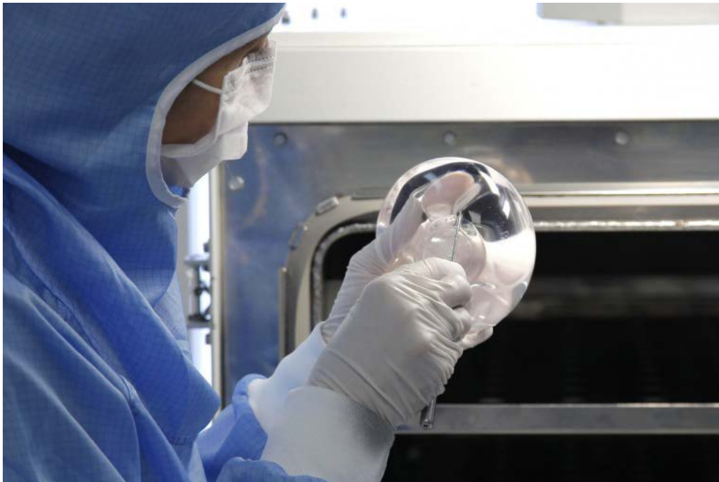
In a country where beauty is everything, not being able to find quality, FDA approved breast implants has Venezuelan women complaining and being forced to settle with lower-quality Chinese implants that rupture easily causing even more damage to women.