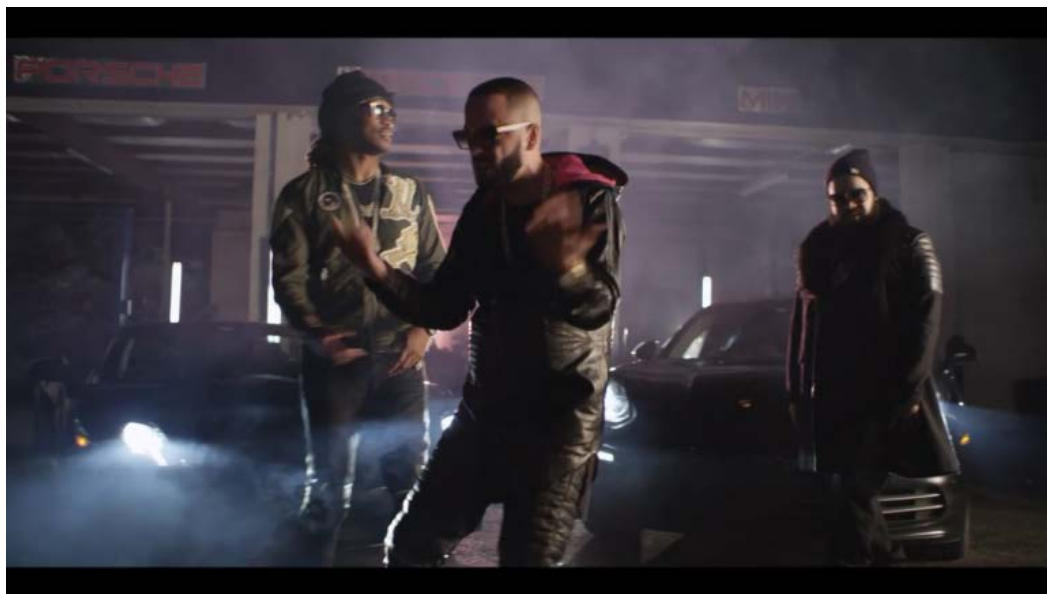
Still of the music video for "Mi Combo" with Yandel and Future.

But what is really setting Spiff apart from all the other producers out there, is that he's bringing together the Hip Hop and Reggaeton markets, combining their sounds, their beats, each artist's swag and their own personal style and creating a whole new sound that we can start appreciating in Yandel and Future's song "Mi Combo," out now . That song is part of Spiff's upcoming 2016 album, along with other mind-blowing collaborations.