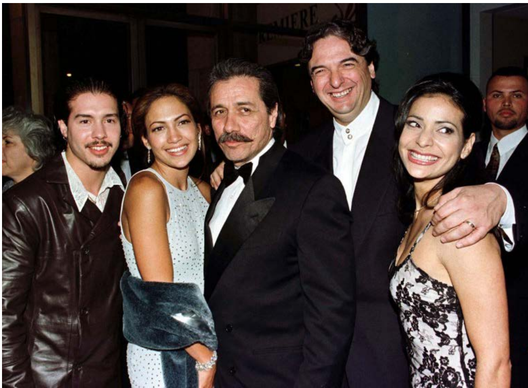
The cast and director of the new film "Selena" pose for photographers March 13, 1997 in Hollywood at the film's premiere. Shown (L-R) are Jon Seda, Jennifer Lopez, Edward James Olmos, director Gregory Nava and Constance Marie. The film chronicles the life of Selena, the popular Tejano music star who was murdered at age 23 in 1995.