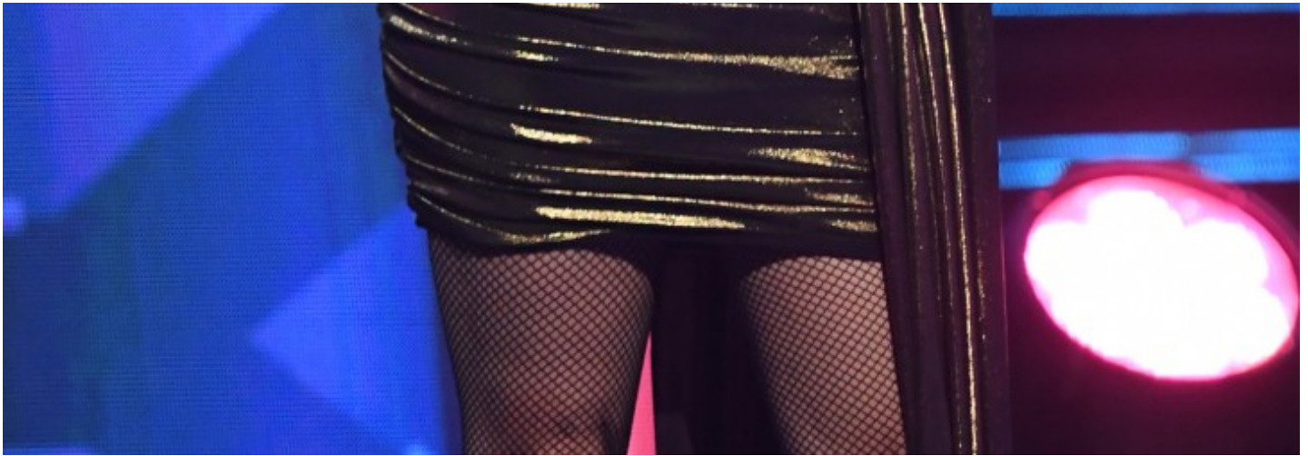
Nothing stopped her from staying true to her commitment to the Latin Grammys.