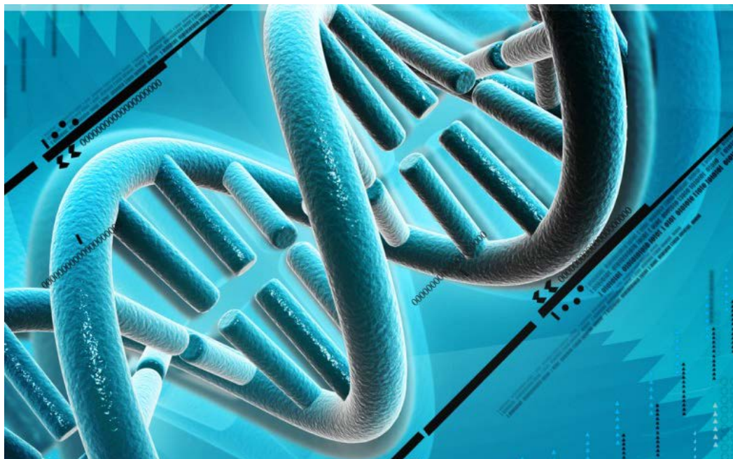
A professor from Berkeley University has come to the conclusion that the perfect human hails from this Caribbean island.