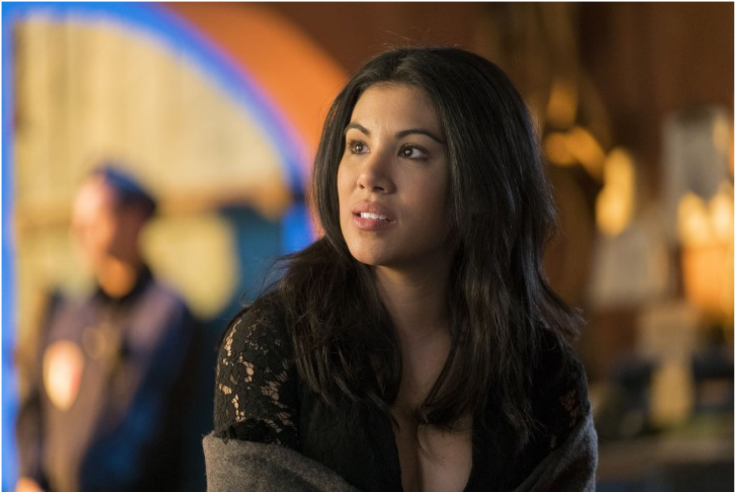
Chrissie Fit as Flo Fuentes during a scene on "Pitch Perfect 3."