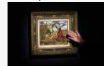
Lifestyle Frida Kahlo Painting Fetches Record $8M At Christie's Auction