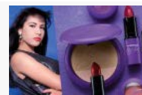
Lifestyle MAC Cosmetics Reveals New Selena-Inspired Makeup Products

5) If you had to bring anything from Cuba, what would it be?