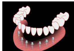
Here's What Dental