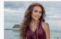
Telenovelas Angelique Boyer Frustrated Over Cutting Of 'Tres Veces Ana' Scenes