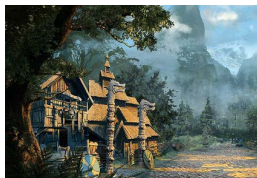
This is the Most