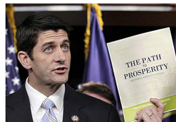
Homeowners Argue To