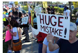
If You Own A Home You