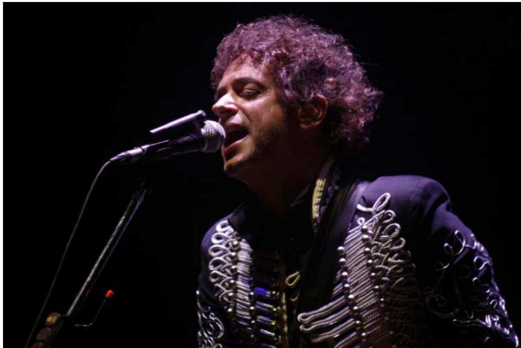
Gustavo Cerati has died, according to his doctor. The Argentine musician and front man of Soda Stereo died from respiratory arrest following 4 years in a coma.