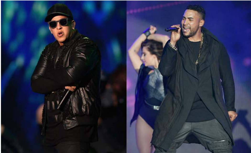
Daddy Yankee and Don Omar, seen here performing at the 2016 Billboard Latin Music Awards at the BankUnited Center in Miami.