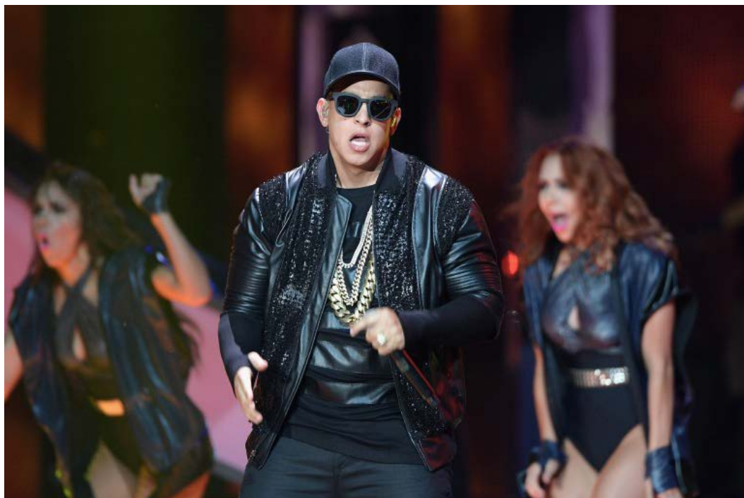
Daddy Yankee performing at the 2016 Latin Billboards.

But they could've found a way of having these two great artists — the ones to really transform the genre into an “acceptable” one that wasn't only heard in the slums but also appealed to the middle and high class — go at each other and maybe talk about poverty, friendship, love and other “appropriate” themes for a family night.