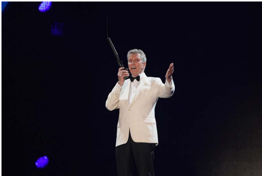
Michael Buffer, famous ring announcer for boxing and wrestling matches, introduced Daddy Yankee and Don Omar at the Latin Billboards 2016.

They sang their other hits “Danza Kuduro” and “Gasolina,” and they wrapped it up with a “Hasta Abajo” remix, which is the version featuring Daddy Yankee.