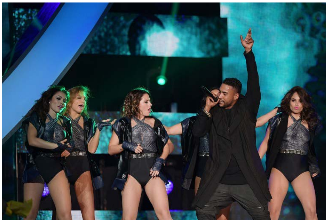
Don Omar performing at the 2016 Latin Billboards.

It could've been more dynamic, it could've shown the real talent of these two amazing artists and performers, and it could've opened the eyes of a lot more people and maybe introduce them to a whole other style that they didn't know existed.