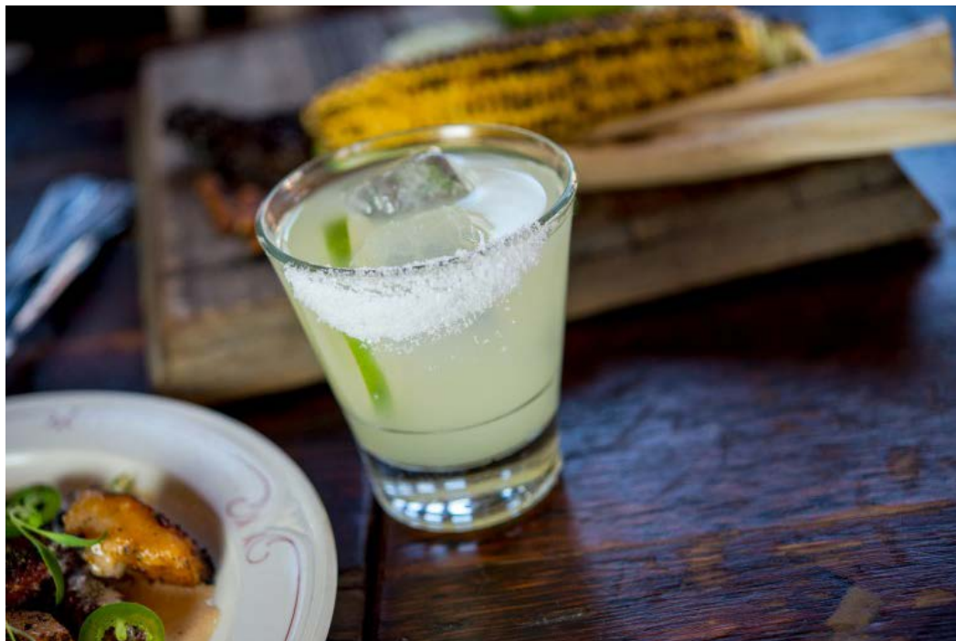
Stay cool with Añejo's Frozen Blueberry Basil Margarita.

Fill a small cocktail shaker with ice. Pour in the tequila , freshly squeezed lime, blood orange juice and agave nectar. Shake for 15 to 20 seconds. Strain into your glass and garnish with a slice of blood orange or lime.