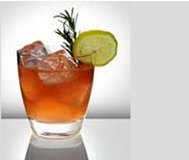
The perfect summer drink!