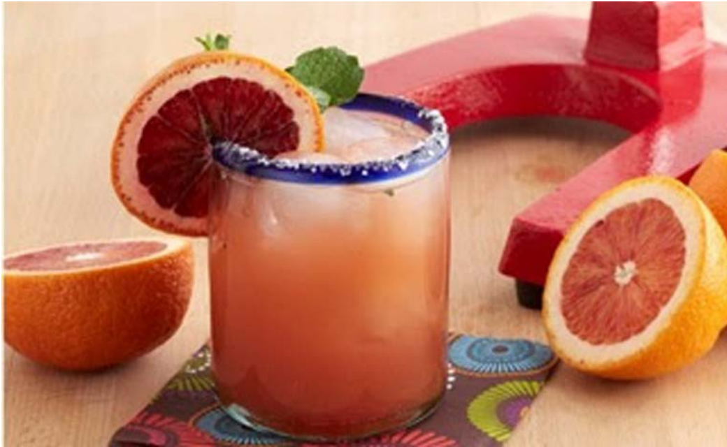
Refreshing and delicious, perfect for a hot summer day! Courtesy Photo

By Maria G. Valdez | Jul 23 2016, 11:53PM EDT