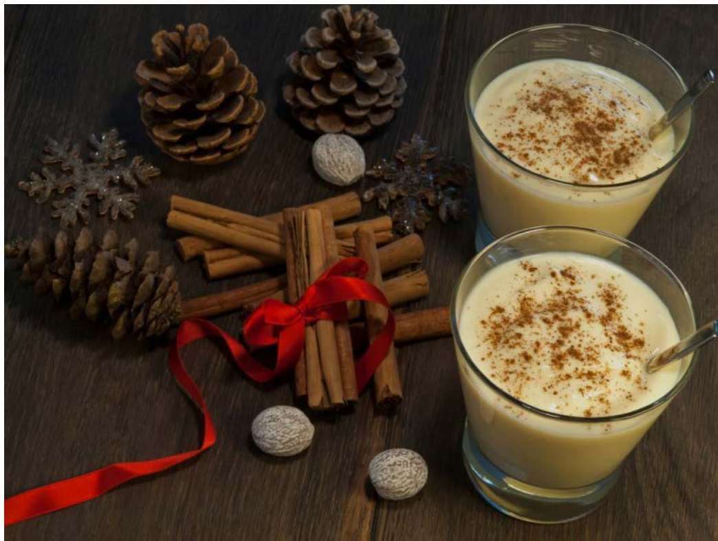
Five eggnog recipes that will make your Holidays even better!