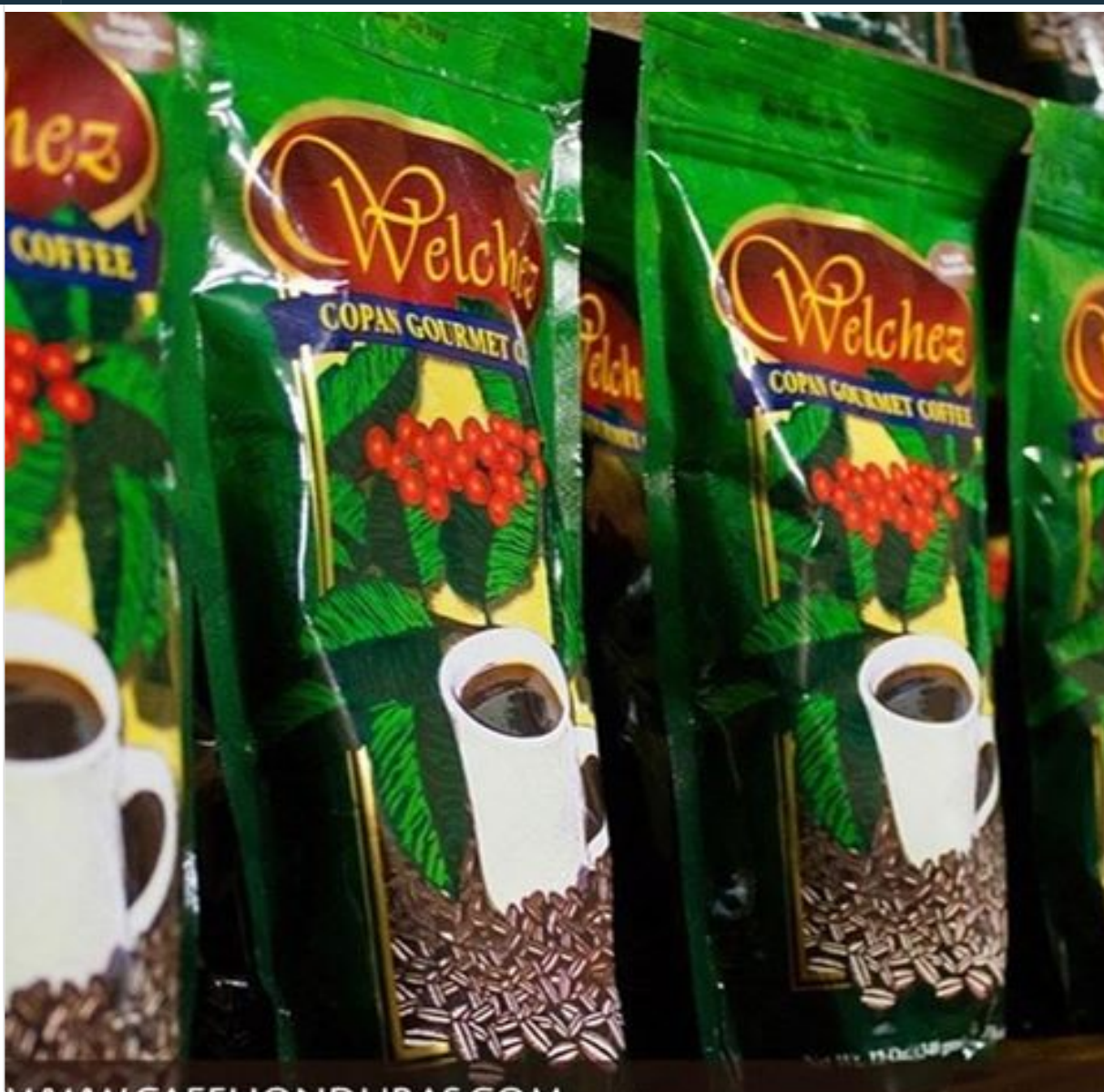
PUERTO RICO: Cafe Yaucono