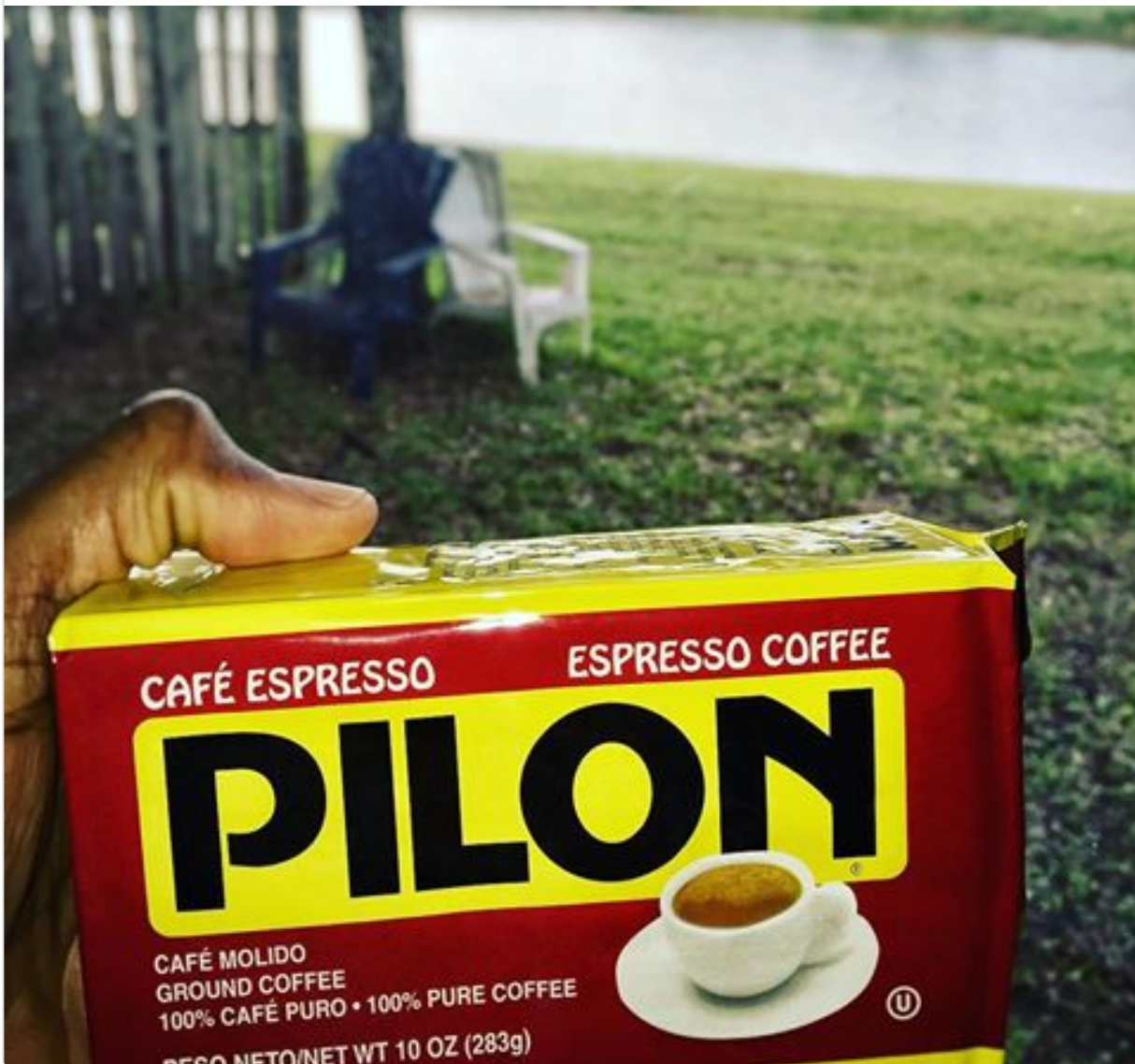
DOMINICAN REPUBLIC: Cafe Santo Domingo