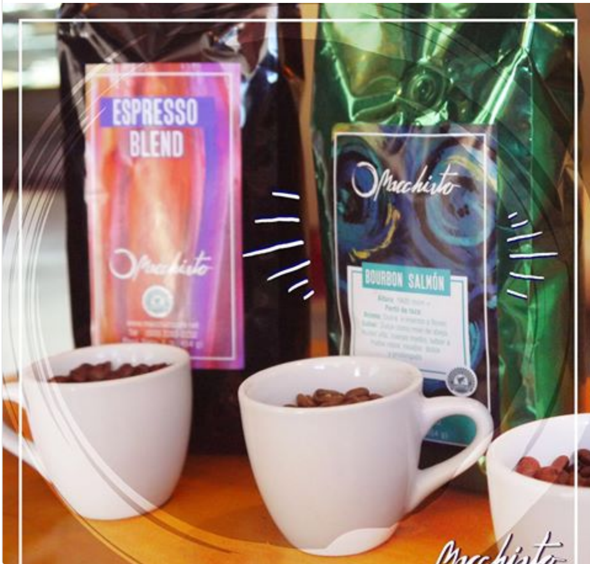
BRAZIL: Cafe Pilão