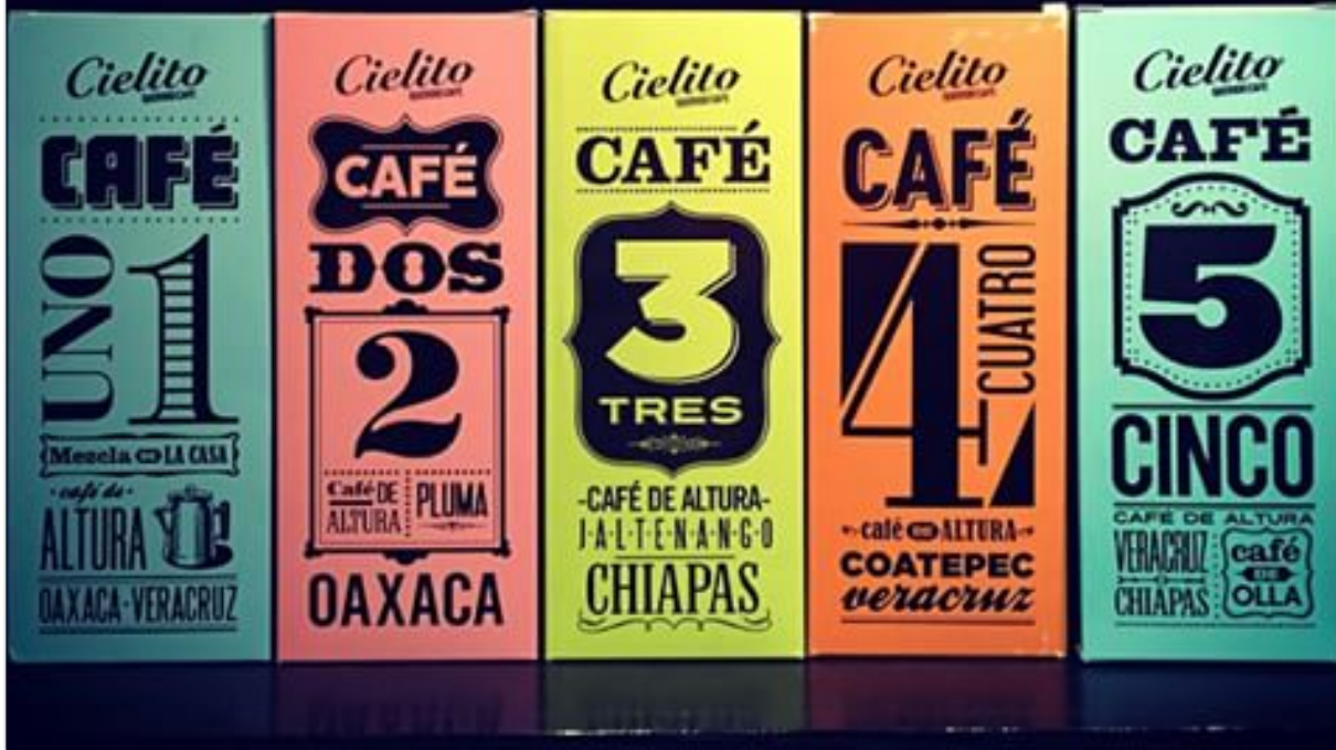
GUATEMALA: El Injerto Coffee