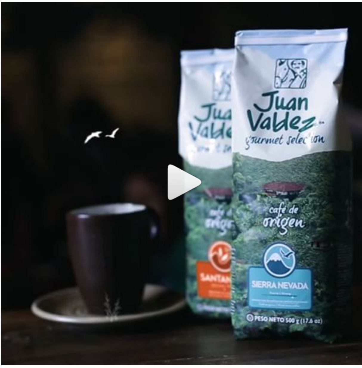
EI SALVADOR: Macchiato