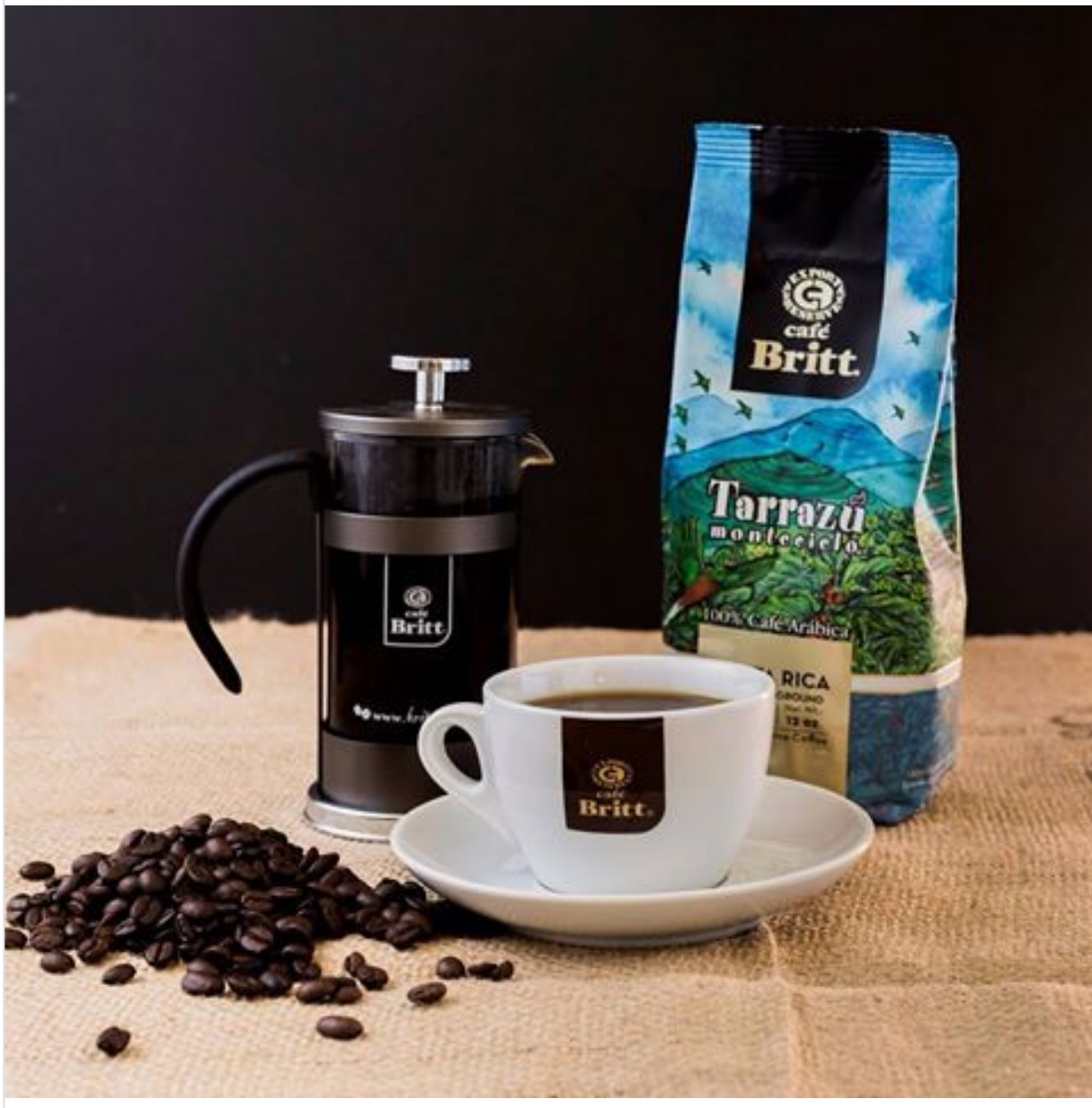
CUBA: Cafe Pilon