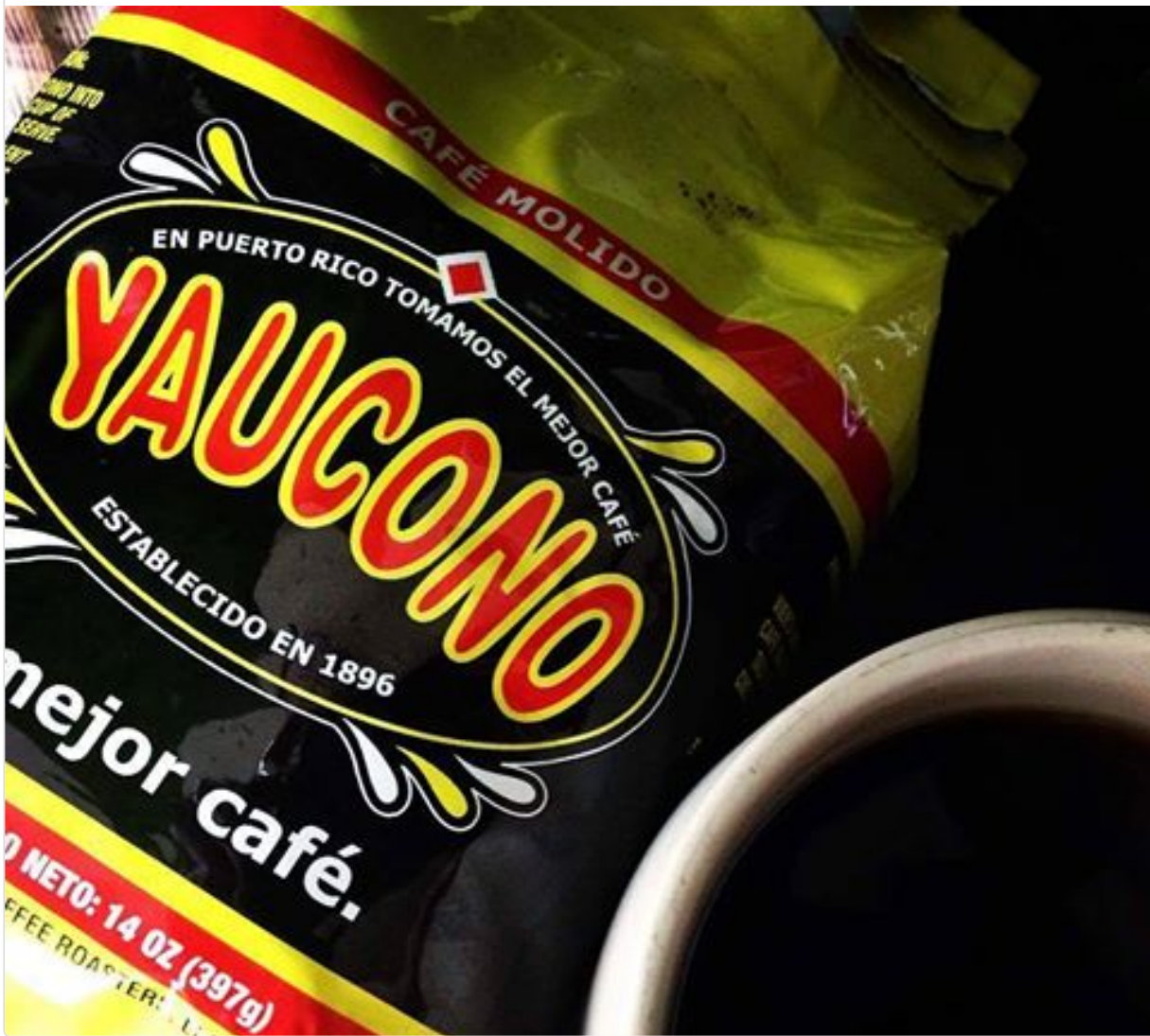
MEXICO: Cielito Querido